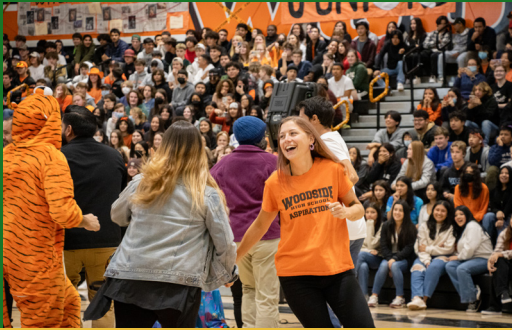
Spirit rally at Woodside High School