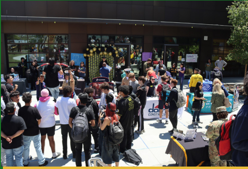
TIDE Academy Career and Club Fair

As we open the chapter on a new year, we'd like to welcome the 2,156 students that are part of this year's freshman class!