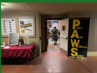
Peace and Wellness Space (PAWS) at Menlo-Atherton