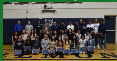
Carlmont High School Commissioner's Cup Champions