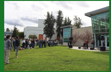
Woodside High School Music Production Club

clubs available across the District for students to join. Full club listings, advisor/club leader contacts, and meeting times can be found on your school's website.