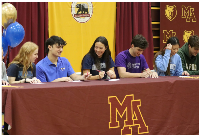
Menlo-Atherton student athletes sign their letters of intent in a signing event on campus on Feb. 7, 2024.