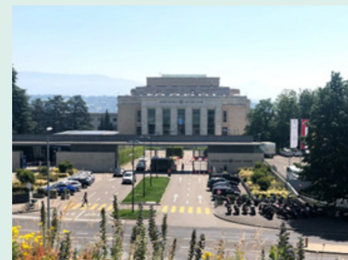
View of the Pregny Gate at the United Nations Office at Geneva, with its main building visible. A road with cars and motorcycles is in the foreground, surrounded by greenery.