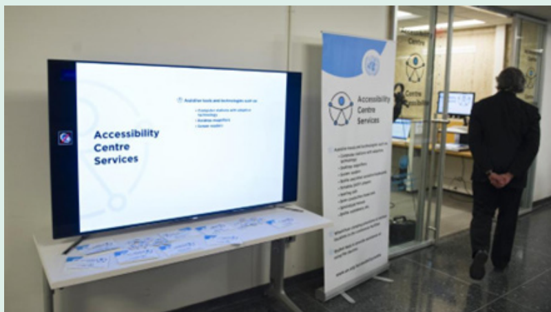
A display screen shows "Accessibility Centre Services" inside a room. A person stands nearby, facing away. A banner and brochures are visible.