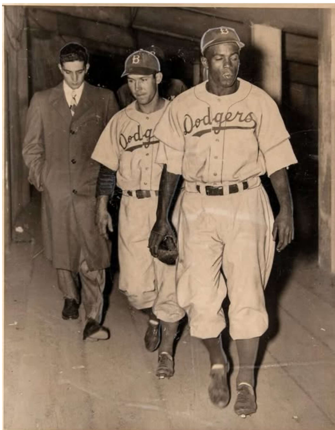
Figure 1: Jackie Robinson, Pete Reiser, and a showered Ralph Branca after a tough game one loss

redemption for Branca. Jackie Robinson finished the series batting .100, but it was an eventful .100 as the above recaps attest. Dixie Walker finished at .588.