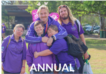
ANNUAL COMMUNITY EVENTS