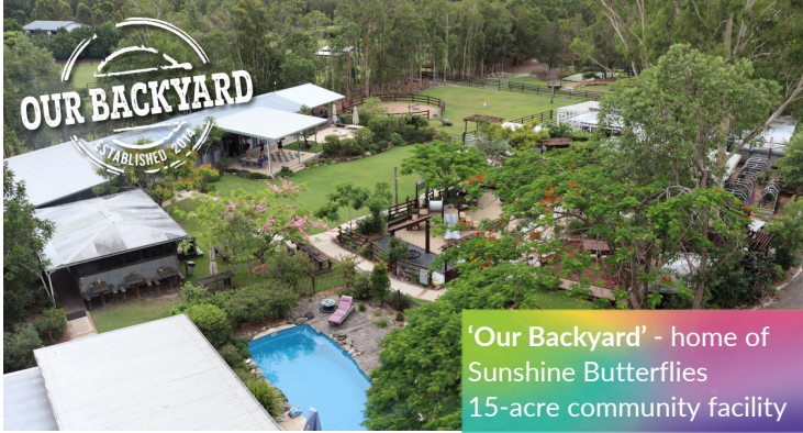
'Our Backyard' - home of Sunshine Butterflies 15-acre community facility