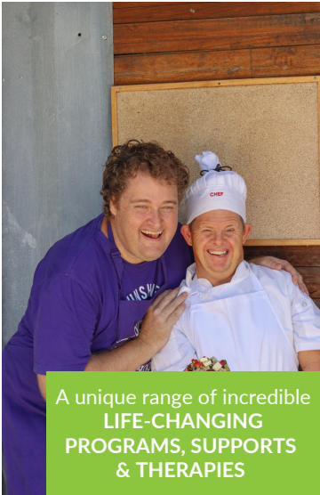
A unique range of incredible LIFE-CHANGING PROGRAMS, SUPPORTS & THERAPIES