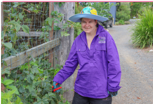
Supported Employment Members Involved in our Pantry, Gardens, Laundry & Enterprise

SUPPORTED INDEPENDENT LIVING & TRANSITIONAL HOMES