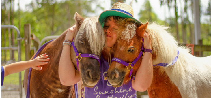
A family of furry, feathered and fluffy FARM ANIMALS