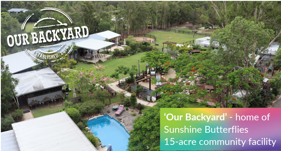
'Our Backyard' - home of Sunshine Butterflies 15-acre community facility