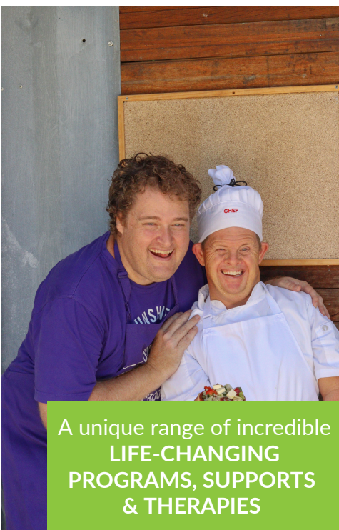
A unique range of incredible LIFE-CHANGING PROGRAMS, SUPPORTS & THERAPIES