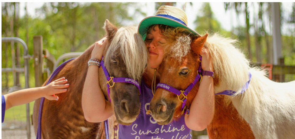
A family of furry, feathered and fluffy FARM ANIMALS