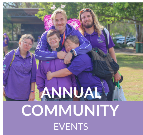
ANNUAL COMMUNITY EVENTS