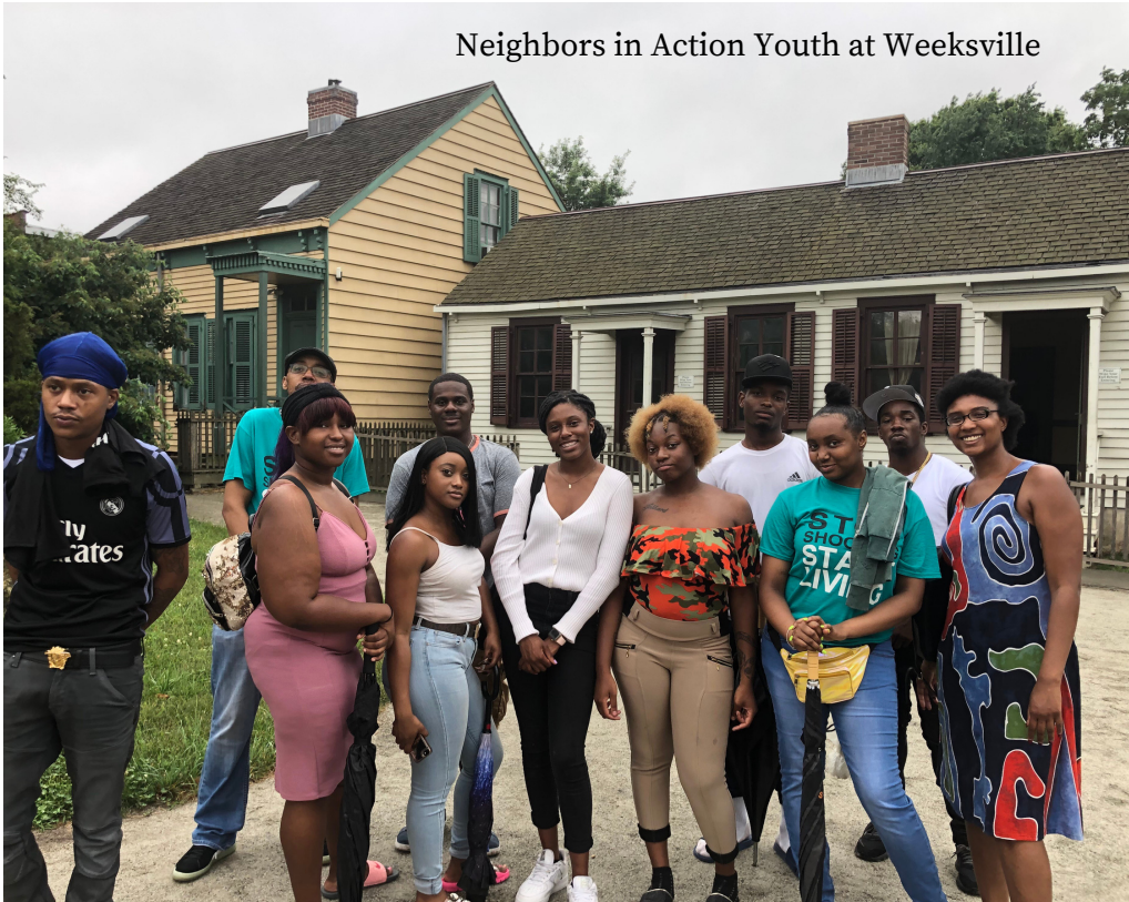
Neighbors in Action Youth at Weeksville